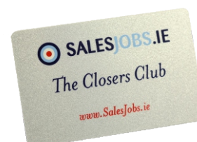
Sales Jobs Member Card Foilt Print

Magnetic stripes can be placed either at the top of the card or at the bottom of the card. Please allow 25mm from edge of card. A background image can go underneath the stripe, but keep text outside the 25mm boundary.