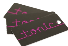
Tonic Member Keytag Foil Print

Otherwise you run the risk of having the artwork from the tag above being split onto the tag below.