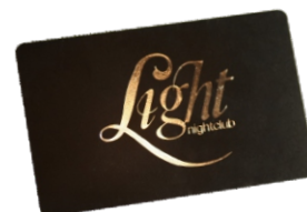
Light Nighclub Member Card Foil Print

When sending any sensitive data, we recommend encrypting the files and sending us the password separately by email or SMS (phone us to get the number)