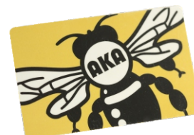
AKA Club Member Card Litho Print

This is a solid colour process only, gradients or halftones cannot be replicated.