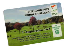
PPUI Union Member Card Litho Print

Bleed Area 92 x 60mm Card Edges 86 x 54mm Safe Zone 80 x 48mm