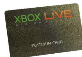
X-Box Live Platinum Card Platinum Finish

If you use a low quality or low resolution logo in your artwork, it will be reproduced faded, blurred or pixelated on the finished product. We are not responsible for this once you have approved the artwork.