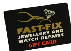
Fast Fix Gift Card Digital Print