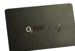
O2 Point Club Member Card Foil Print