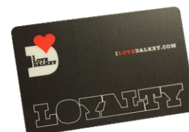
I Love Dalkey Loyalty Card Matte Finish

want to design your own cards? - read on