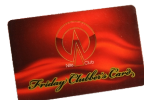
Q Club Member Card Digital Print

we will send you a proof with your artwork laid out