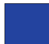
Pantone Reflex Blue

Pantone colours look different when converted to CMYK