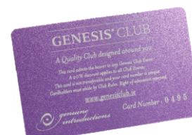
Genesis Club Member Card Foilt Print